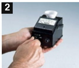
2 Select Conductivity/TDS range