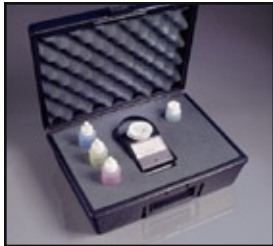
Porta-Kit with EP11/PH

All Myron L instruments are factory calibrated with Standard Solutions of known conductivity/TDS values and (when appropriate) with pH buffer values 4, 7 and 10. These solutions and buffers are traceable to the U.S. Government's National Institute of Standards and Technology.