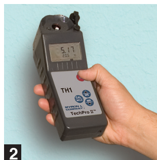
Push button to display reading