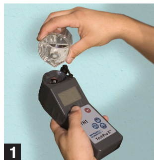
Rinse and fill cell cup