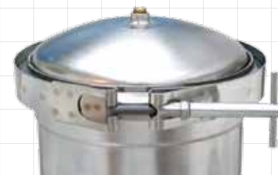
Band Clamp Assembly