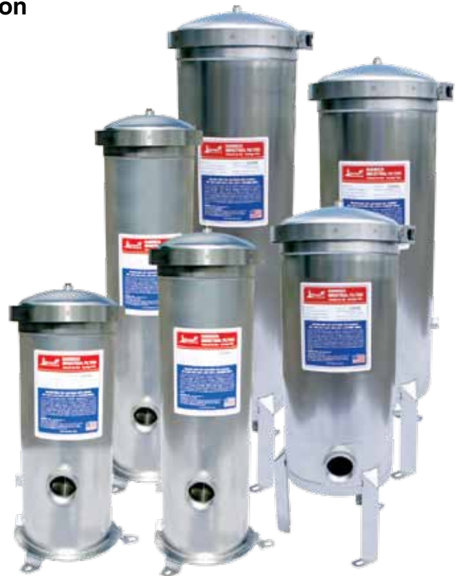
Models BC4-1, BC4-2, BC4-3, BC6-1, BC6-2, BC6-3

316 stainless steel Sanitary, BSTP or victaulic connections