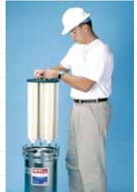
Cartridge Cluster Filters

All cartridges in our 7, 14, 16, 21 and 24 models are arranged in a single "cartridge cluster," so all cartridges are removed at one time for easy cartridge cleaning or replacement.