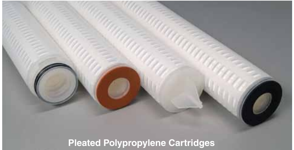
Pleated Polypropylene Cartridges