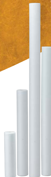
POLYDEPTH® Polypropylene Sediment Cartridges

Available in different lengths from 9¾" up to 40". Unlike competitive cartridges, the longer lengths are not manufactured from shorter cartridges that are glued together. They are continuous units that cannot separate during use. POLYDEPTH cartridges are available in various micron ratings including 1-, 5-, 10-, 25-, and 50-microns.