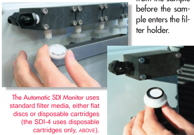
The Automatic SDI Monitor uses standard filter media, either flat discs or disposable cartridges (the SDI-4 uses disposable cartridges only, ABOVE).

Continuous Sample Flow - The Automatic SDI Monitor is designed for permanent installation. In order to prevent stagnant conditions in the sample line, the monitor continuously allows a side stream of sample to flow through the monitor up to the point where the sample enters the filter. A specially designed orifice controls the rate of this side-stream flow. The orientation of the flow control orifice also allows air in the sample line to be separated from the sample before the sample enters the filter holder.