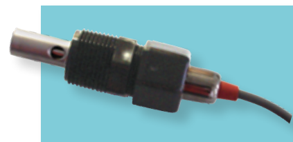
Assembled Resistivity Sensor

The CS10 was designed primarily for use in pure water applications.