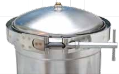
Band Clamp Assembly