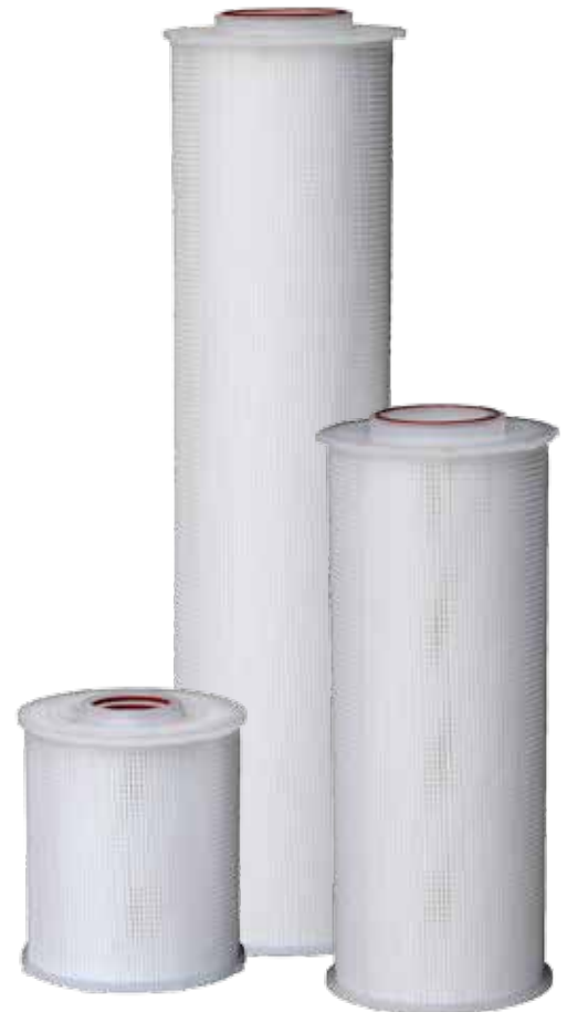
Premium Hurricane® All-Poly Cartridges