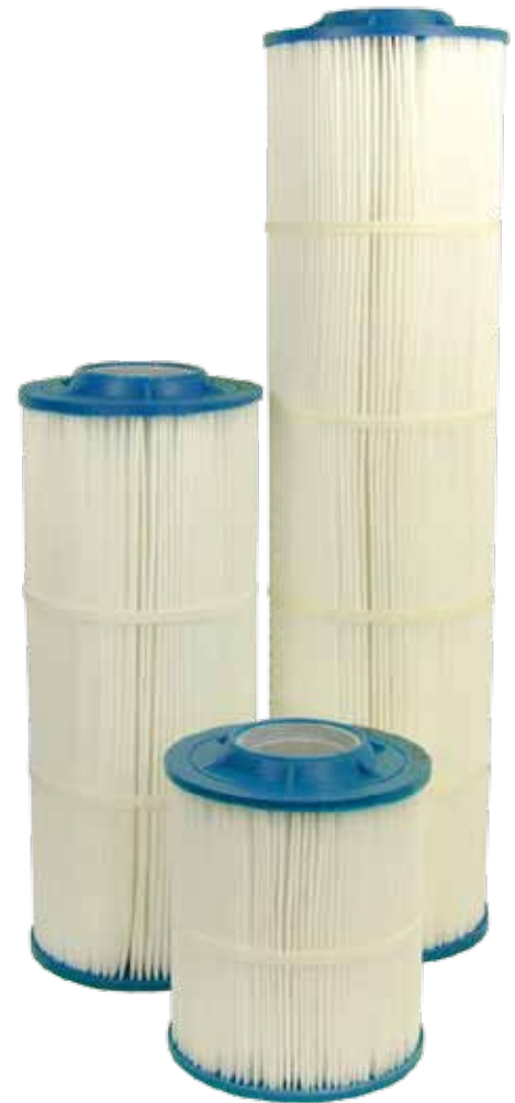
Premium Hurricane® Polyester Cartridges