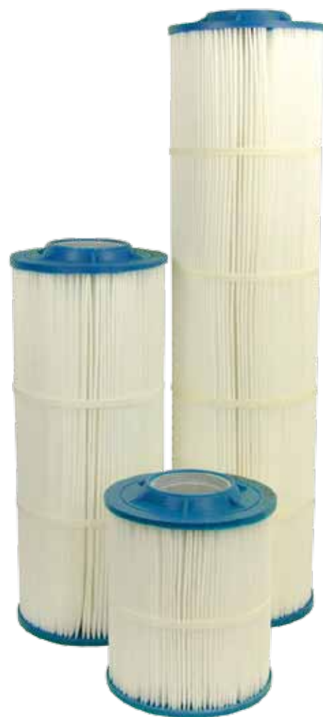
Premium Hurricane® Polyester Cartridges