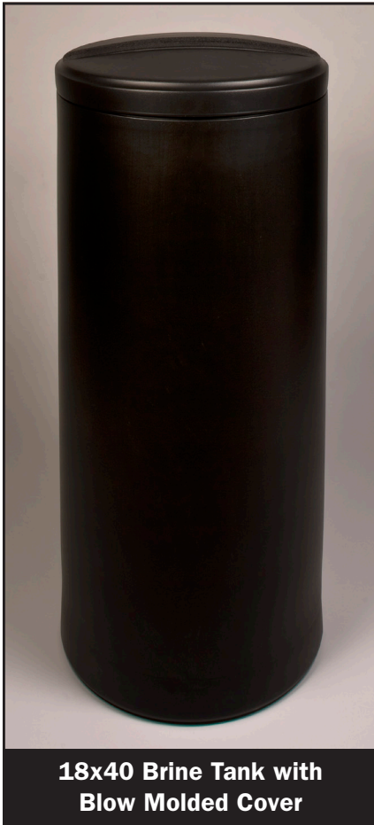
18x40 Brine Tank with Blow Molded Cover