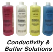
Conductivity & Buffer Solutions

Note: pH 7 Buffer is especially important and should be used every 1-2 weeks.