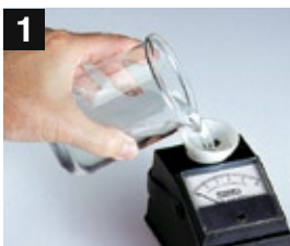
Rinse and fill cell cup