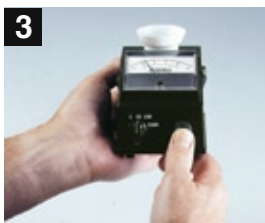
Push button to indicate reading