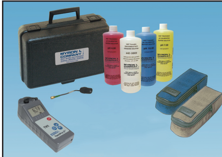
The TechPro II Line of Accessories: pH Buffers, Storage Solution, Replacement pH Sensor, & choice of Soft or Hard Protective Carry Case