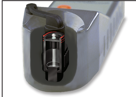
The pH sensor chamber protects a large-capacity, long-life KCl reservoir.