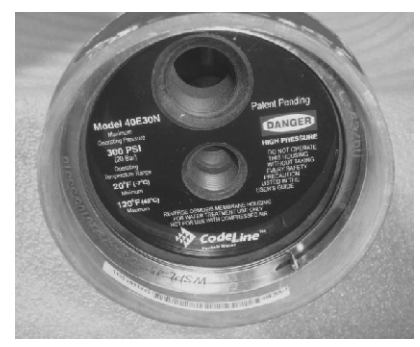
Retaining ring seated in the grooove

6. Check that the spiral retaining ring is fully seated in the groove. If it is not, remove and check for foreign material that is causing the spiral ring not to sit into the groove.