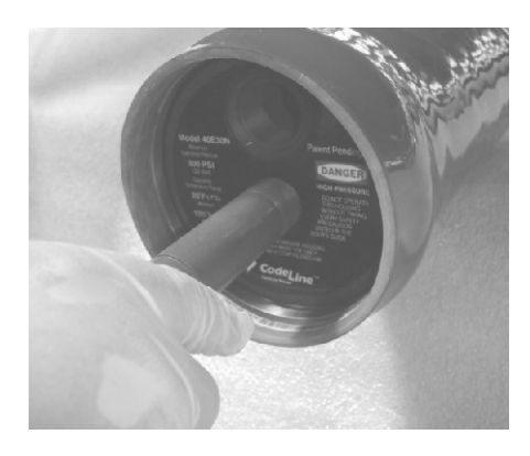
Installation of the End Plug Assembly into the vessel

4. Orient end plug port into desired position and push plug fully into vessel. A sharp, forceful thrust may be needed to enter plug seal into the vessel bore.