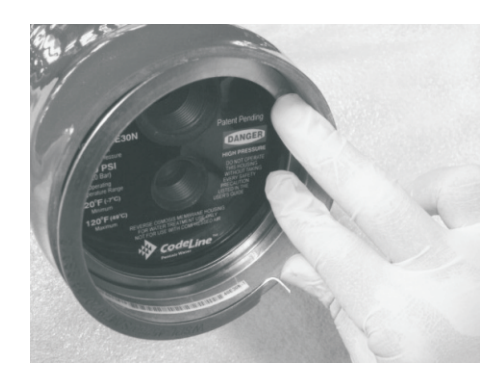
Inserting Retaining Ring into the groove

5. Carefully insert retaining ring into its groove. This is done by inserting the lead end of the spiral retaining ring (the non bent tab end) into the retaining ring groove located in the shell, and slowly pushing the remaining turns into the shell.