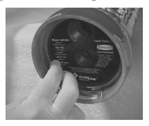
Removal of Retaining Ring

2. Remove the 4" retaining ring from the stainless steel groove in the shell by rotating your finger behind the ring as it continues to exit the groove.