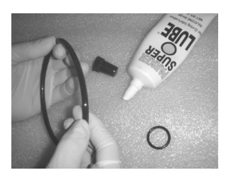
Lubricating Plug seals and O-rings

4. Insert the Head Seal O-ring into the groove on the outside diameter of the End Plug.