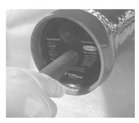
Removing the head assembly