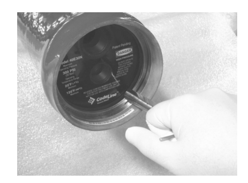
Retaining Ring Removal Tool

With the removal tool the retaining ring can be lifted upward by simply rotating the tool counterclockwise after inserting it over the tab on the retaining ring (Use the smaller hole). Hold the tool flat against the end margin and parallel to the vessel bore. It is then possible to pull the end of the retaining ring straight out. The retaining ring may snap back into the groove if this alignment is not closely adhered to. If the retaining ring is difficult to remove, try soaking with a release agent such as LPS<sup>TM</sup> or WD4<sup>OTM</sup>, being careful to avoid any contamination of a membrane element.