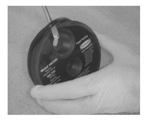
Removal of the Plug Seal