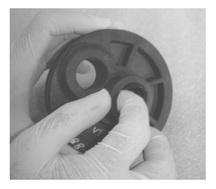
Inserting Adapter seal

3. Assemble the Adapter Seal into the groove in the End Plug.